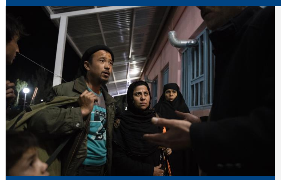
A returnee family arrives at the Herat Transit Center at night after being deported from Iran. During their journey they were kidnapped by smugglers and held for ransom.