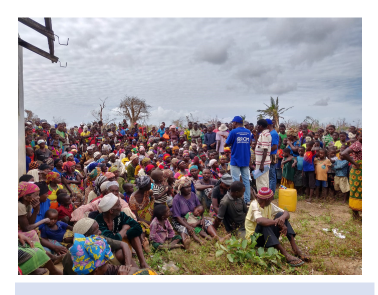
196 HH assisted with NFIs in district of Macomia, Cabo Delgado.

Shelter/NFI assessments are being conducted in several locations to monitor distributions carried by implementing partners and identify needs of the populations.