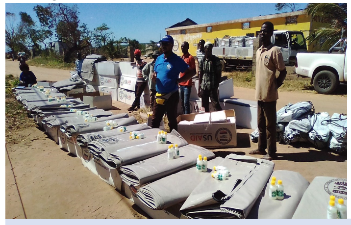
IOM Shelter-NFI teams assisting 2,060 households in Nanga A, Macomia Sede, Cabo Delgado Province. @ IOM 2019

From 17 to 31 May, in the district of Macomia, 4,067 HH have been reached with shelter and NFIs. In-kind materials are in transit coming from the Shelter/NFI and WASH Common Pipelines in Pemba. Since March 2019, the Shelter/NFI Common Pipeline has released more than 10,000 plastic sheets and 500 shelter tool kits for distribution in Macomia and 32 bales of blankets and 147 kitchen sets for the households in the Tratara Transit Centre in Metuge.