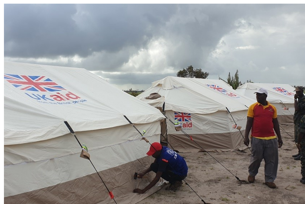
At the request of the INGC, IOM set up 30 family tents from UKAID at the Muavi relocation site in Beira.