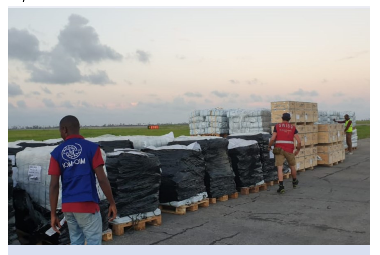
IOM and SDC staff take stock of newly delivered shelter kits in Beira

In total, IOM has received 205 family tents (including 100 from UKAID; 100 from Italy and 5 MPT from SDC), 12,000 tarps, 4,200 blankets, 1,000 solar lamps, and 500 shelter tool kits. IOM has distributed over 4,004 shelter NFI and tool kits via road distributions in close coordination with INGC. Mixed inter-sectoral distributions by air and road have been done in coordination with Shelter, Food Security, WASH and Logistics Cluster partners. In addition, IOM is co-sharing a warehouse in Beira and presently expanding office and accommodation space in the devastated city.