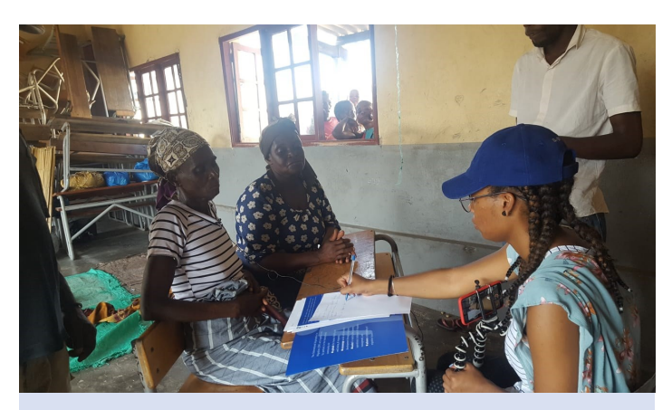
IOM interviews flood affected women at a displacement site in Mataouro. IOM is collecting demographic and intention data through the Displacement Tracking Matrix

The DTM team is also geo-coding the sites to ensure they are properly registered and mapped to allow for service extension by response partners.