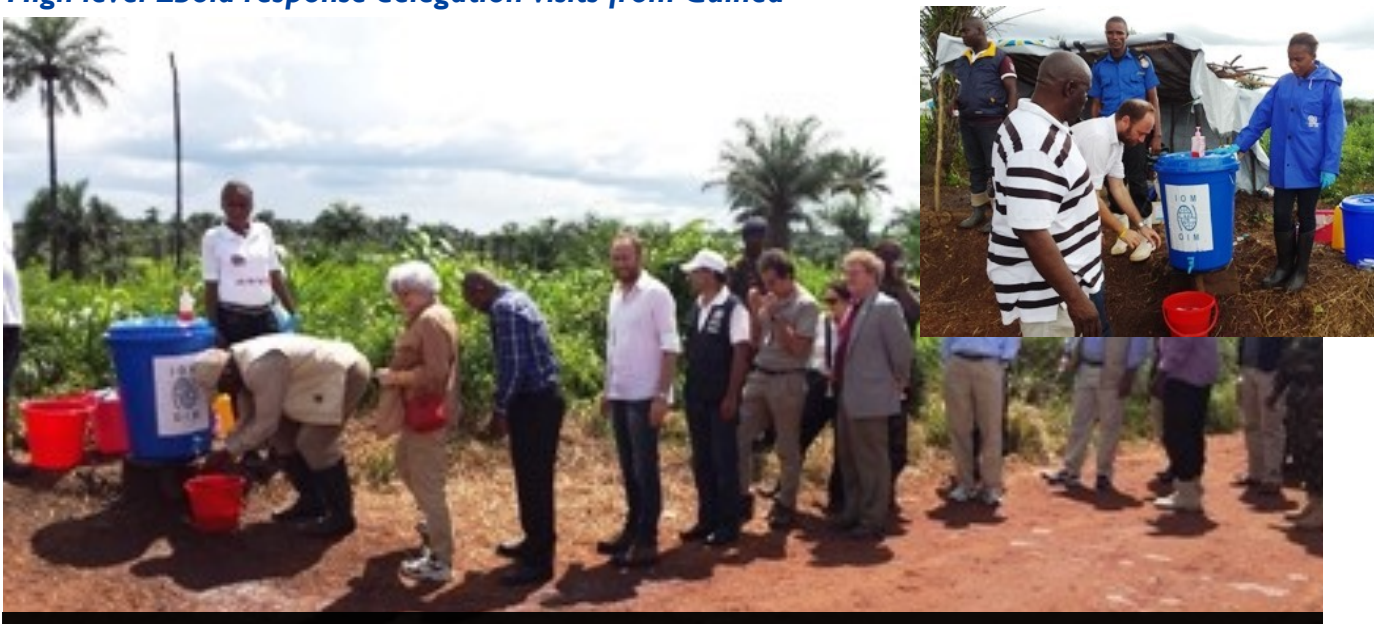
A high level visiting delegation from Guinea joined by the Kambia district coordinator and the UN field coordinator outside of Sella Kafta community.

The outbreak in Sella Kafta community in Tonko Limba Chiefdom, Kambia District drew major interventions from NGOs and UN agencies including IOM which set up