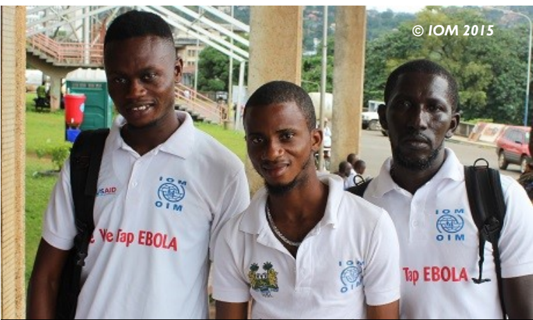
diarrhea all IOM social Mobilizers at Siaka Stevens Stadium on 25 September 2015.

After torrential rains on 16 September, roughly 14,000 persons have been displaced throughout the city of Freetown. Given that many of the worst affected communities are low lying coastal slums where unsanitary conditions made many times worse by floods can easily cause a rise in waterborne diseases like cholera and watery mobilizers have now been trained on rele-