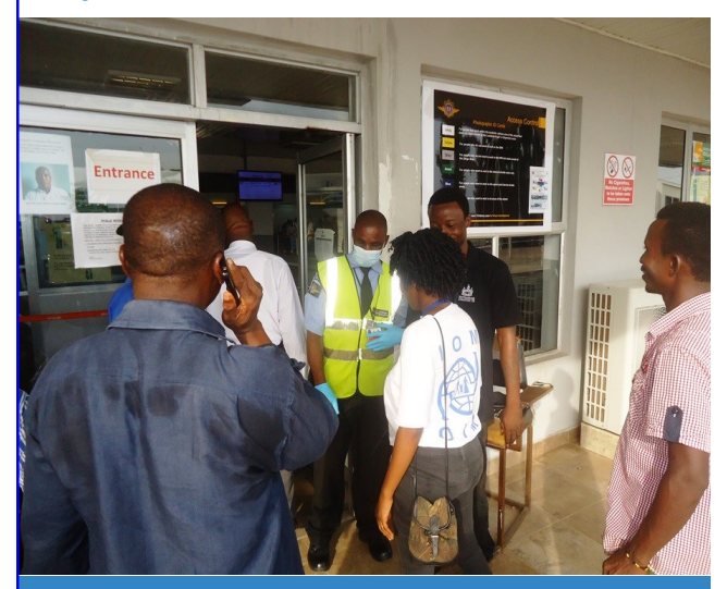
Monitoring Airport entry screening