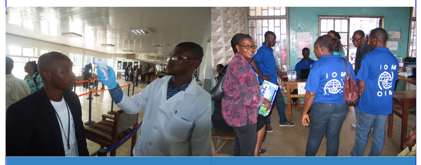
IOM staff member undergoing health screening process

Registration day at the Training Academy