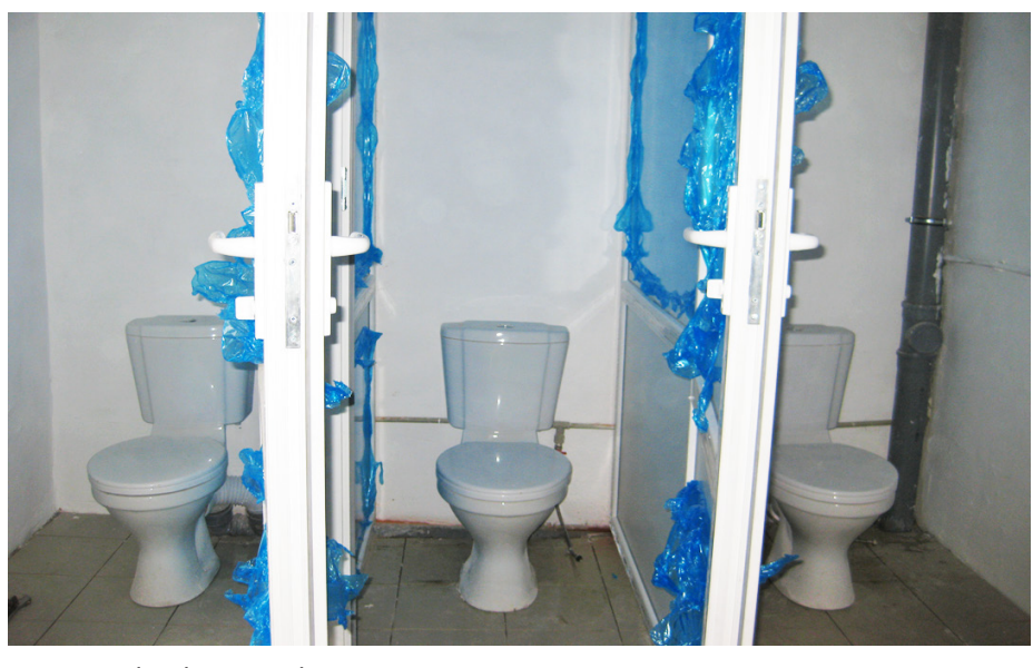
Renovated toilets in a dormitory in Yasynuvata

The three years of ongoing conflict in Eastern Ukraine has played a substantial role in the degradation of the economic situation within the region and particularly in the NGCA, with large industrial enterprises having partially or completely closed. The shortage of