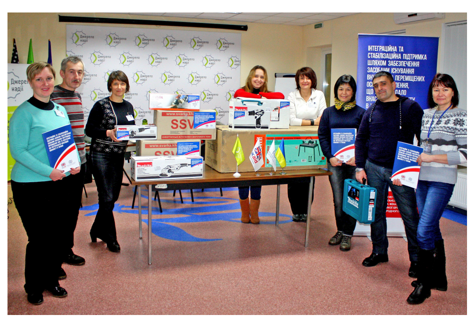
UK-funded project grantees in Vinnytsia receiving equipment

With funding from the European Union and the United Kingdom's Department of International Development (DFID), IOM continues its targeted livelihoods assistance programme, engaging IDPs and host community members in career development training, self-em-