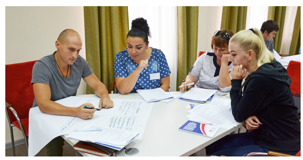
Training participants in Sumy brainstorming marketing strategies

business and wider community goals, IOM has supported the launch of the 'National Business Exchange Platform', an innovative online and offline resource for networking, webinars and events on business development, a vacancy board and a hub to exchange ideas. By the end of September, nearly 1,300 individuals were registered and using the Platform's resources. The official presentation of the National Business Exchange Platform in Kyiv will take place on 24 October.