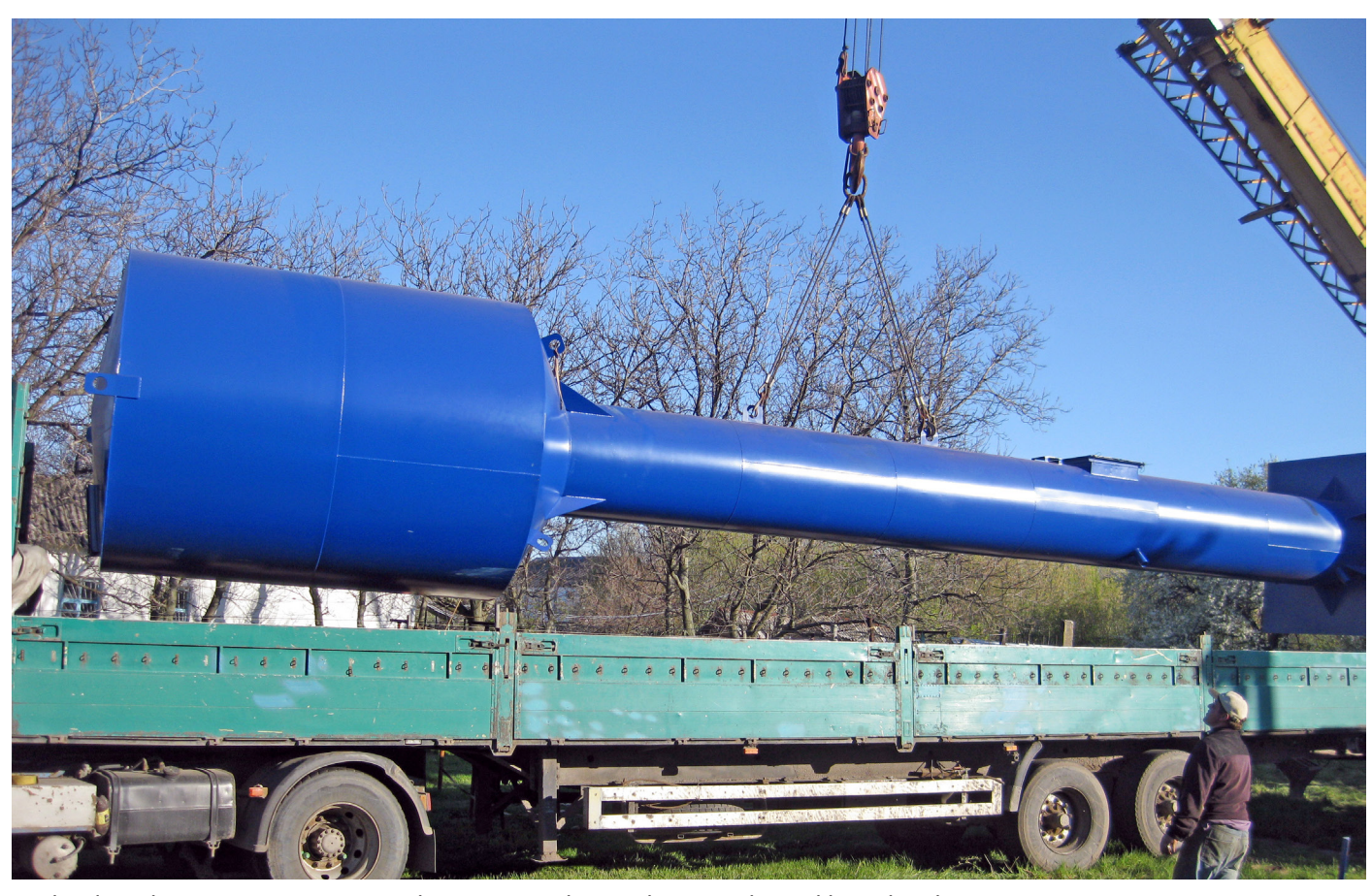
Unloading the new water tower at the Amvrosievka psycho-neurological boarding house

IOM, through its local implementing partner, assisted in rehabilitating water, sanitation and hygiene-related (WASH) facilities in 20 social institutions, such as hospitals, IDP centres, territorial centers for social services, psycho-neurological and prenatal centres, in the non-government controlled area (NGCA) of the Donetsk Region. In total, approximately 5,000 people benefitted from this intervention, which was made possible through funding from the European Commission Directorate-General for Eu-